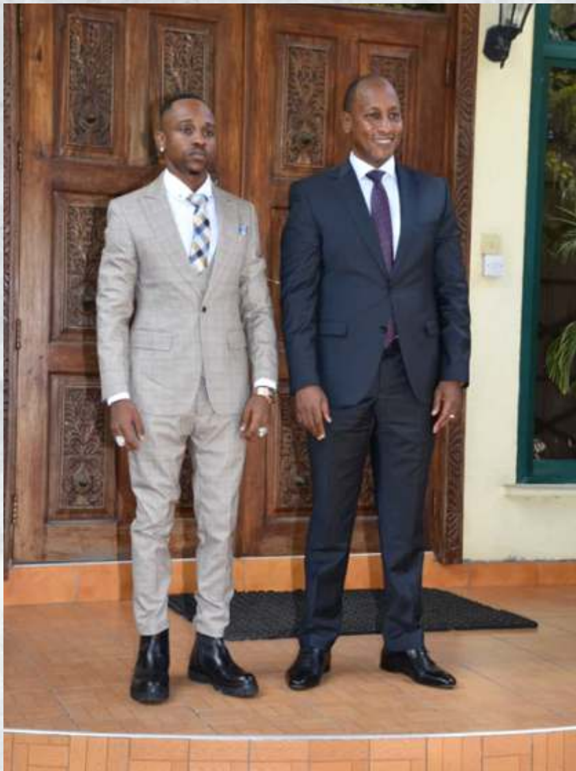
Tanzanian artiste, Ibrahim Abdallah Nampungu popularly known as Ibraah